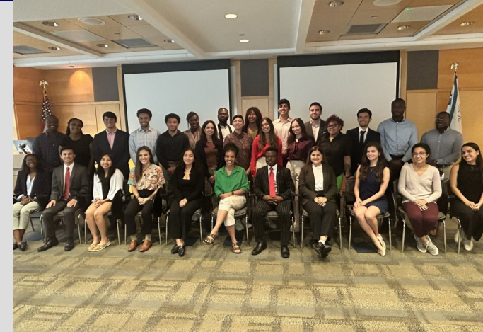
2023 SRTP Students