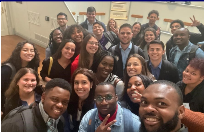
SRTP 2023 Orientation