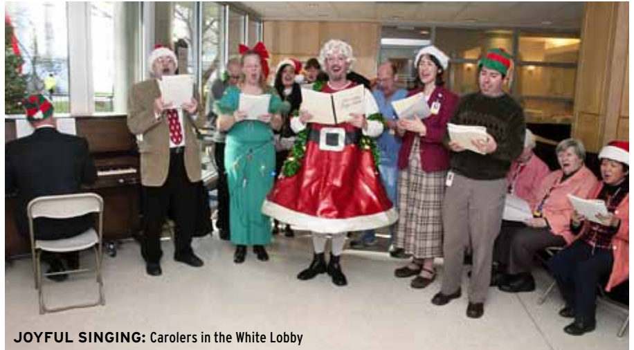
JOYFUL SINGING: Carolers in the White Lobby