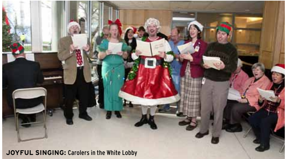
JOYFUL SINGING: Carolers in the White Lobby