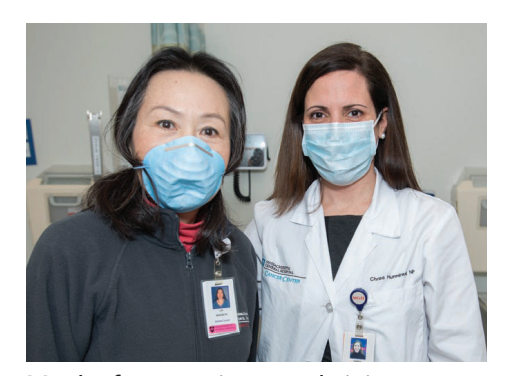
Masks for caregivers and visitors