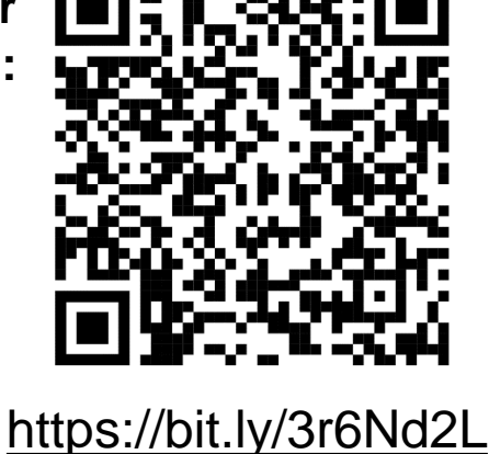
Weekly webinar registration:

E-mail:healeyalsplatform@mgh.harvard.edu