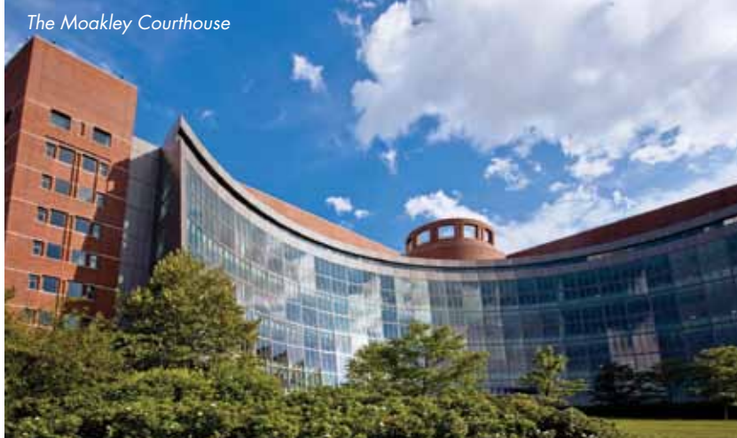
The Moakley Courthouse