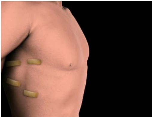
FIGURE 3. With the stomach mobilized, the patient is turned and the esophagus is resected and removed through four small incisions in the chest, avoiding spreading of the ribs.

Given these high rates of postoperative morbidity and mortality, minimally invasive techniques to esophagectomy are gaining popularity in an attempt to improve outcomes. MIE is performed with small incisions using laparoscopic and thoracoscopic skills (Figures 2-3). One of the largest series to date reported postoperative major morbidity ranging between 2% and 5% for specific