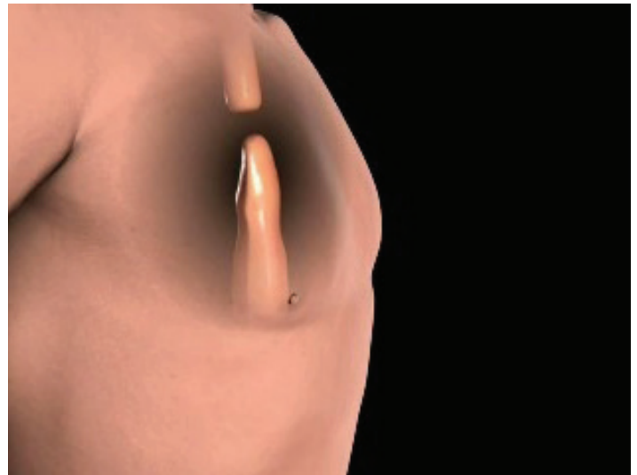
FIGURE 1. With an esophagectomy, the tumor is resected and the stomach is used to reconstruct the esophagus that has been removed.

Esophagectomy remains a mainstay in the treatment of early or locally advanced esophageal cancer and typically involves removing a portion of the esophagus and reconstructing it with the stomach (Figure 1). Historically, esophagectomy has been associated with high rates of morbidity and mortality. In 2002, an analysis of the national