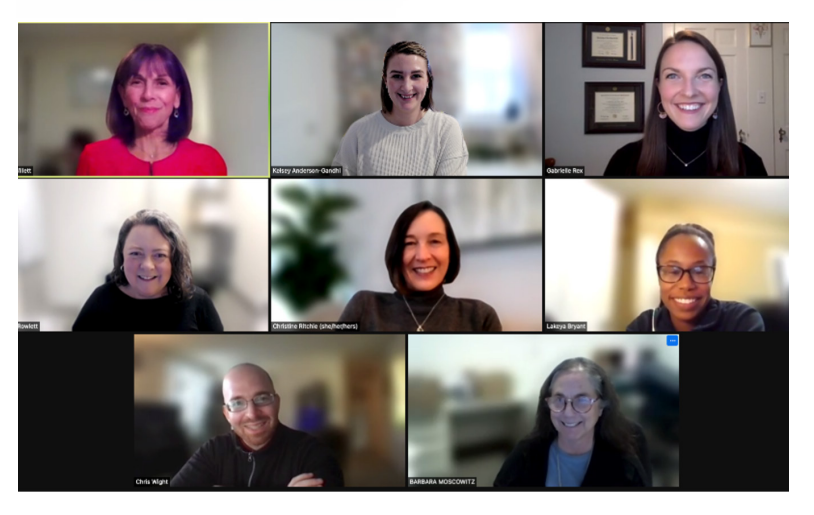
Dementia Care Collaborative Staff - 2021

"Thanks so much for this great service to the caregivers and consequently those with dementia!"