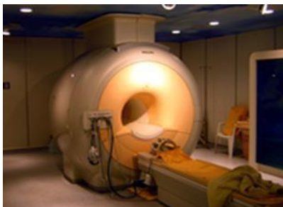
Example of MR-Pet Scanner