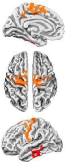
Figure above is an example of a complete brain scan and highlights inflammation in ALS patients.

Inflammation and mitochondrial abnormalities will be measured in different brain regions using a PET dye (tracer) called PBR28 tracer. PBR28 injected via IV (intravenously), reaches the brain by blood and attaches to inflammatory cells in the brain. Using a sophisticated combined (2 in 1) scanner at MGH, which uses both MRI and PET imaging, a single high resolution brain scan will help visualize inflammation areas accurately.