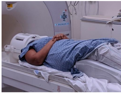
Picture of person at opening of MRI/PET scanner