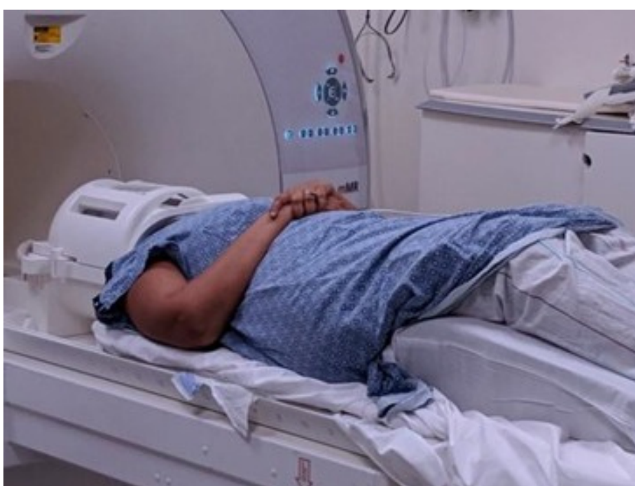
Person at opening of MRI/PET scanner