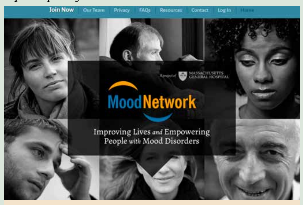
Through the secure website www.moodnetwork.org, participants can contribute information to the largest pool of data ever assembled about mood disorders.

Key advocacy partners with Mass General in the MoodNetwork include the National Alliance on Mental Illness, Depression Bipolar Support Alliance, International Bipolar Foundation, Anxiety and Depression