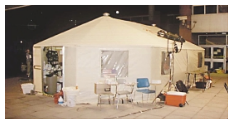
Medical Tent at Ground Zero

successful disaster medical response, especially given the threat of weapons of mass destruction (nuclear, biological and chemical). The National Disaster Medical System (NDMS) is the congressionally mandated Federal Disaster Plan for the US. It is designed to mobilize military and civilian medical assets in the event of a catastrophic event. The NDMS involves three programs: 1) designation of hospital beds: (2) Disaster Medical Assistance Teams (DMAT): and Specialty DMATs in Trauma, Burns and Pediatrics. As a result of the MGH's professional expertise, MGH was asked by the Department of State and the Office of Emergency Preparedness (Health and Human Services) to establish the first of two international trauma teams for the NDMS. The International Medical Surgical Response Team (IMSuRT) is designed to provide a rapidly deployable medical and surgical response team for international emergencies to assist in the extrication, treatment and evacuation of US victims and assist host countries in the care of casualties . The IMSuRT is designed to participate in all four aspects of disaster medical response: 1) search and rescue, 2) triage and initial stabilization, 3) definitive medical care and 4) evacuation. The medical team utilizes a deployable rapid assembly shelter (DRASH) with the capacity for triage and initial stabilization, operative intervention, and critical care.