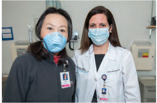
Masks for caregivers and visitors