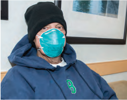
N95 mask for patients