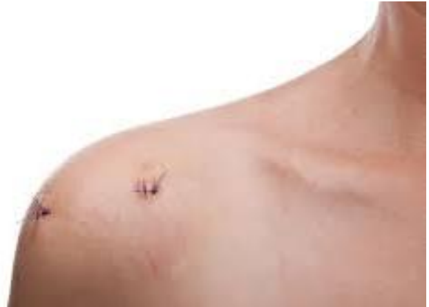
Portal sites after an arthroscopic shoulder surgery.