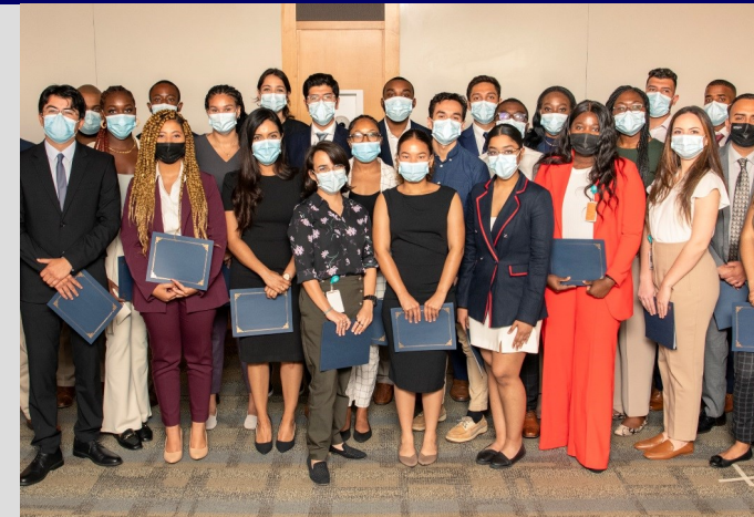
2022 SRTP Students