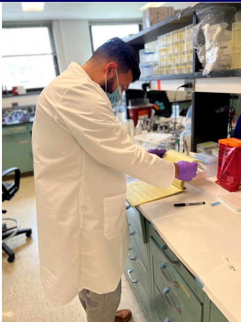
2022 SRTP student in the lab