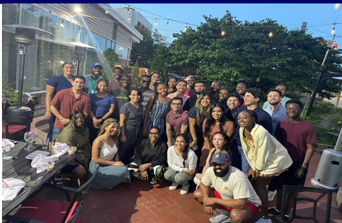
2022 SRTP Social Event