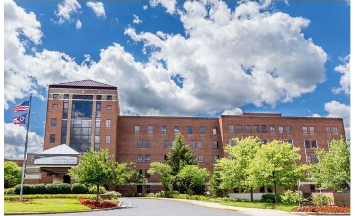
UC Health Daniel Drake Center