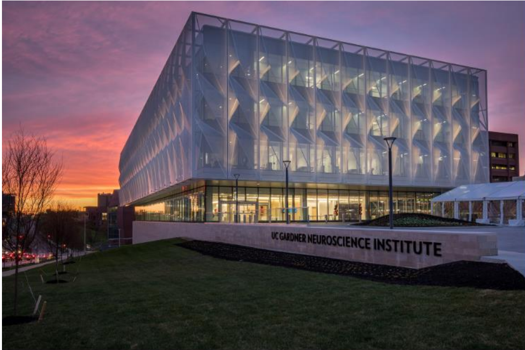
UC Gardner Neuroscience Institute