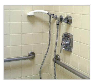
Hand-held shower head