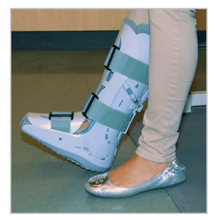
Air cast boot