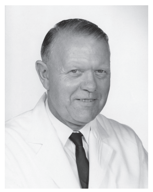
Figure 22.2 Morten Grove-Rasmussen

O whole blood as a "universal donor" source (21) and for his reporting of various serologic studies, he immediately became involved in national blood banking affairs, organizing the Reference Laboratories Program of the American Association of Blood Banks (AABB) in the 1950s. One of the earliest reference laboratories was established at the MGH and continues to operate today. The reference laboratories provided technical assistance in the workup of difficult cross-matching problems as well as a file of donors of rare blood types. The latter service later became the nationwide Rare Blood Donor Registry, which is now administered by the AABB and the American Red Cross (22). More than 30 reference laboratories were established nationally by 1973. Dr. Rasmussen served as the Chairman of the Reference Laboratory Committee of the AABB from 1958 until his death in 1973. He also recognized the importance of standardizing methodology across a wide variety of testing and clinical situations