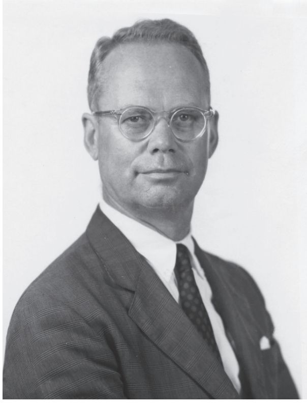
Figure 22.1 Lamar Soutter

Lamar Soutter (figure 22.1) was born in 1909, the son of a surgeon. He graduated from Harvard College in 1931 and HMS in 1935. After completing his surgical training in New York City, he returned to Boston as a surgeon at the MGH in 1940. Aware of the universally accepted utility of blood transfusions and of the merits of the blood bank system set up in New York City for its municipal hospitals, he set about trying to establish a blood bank at the MGH. By March 1942 "the ranks of the opponents had become seriously depleted because of defections to the armed forces," (19) so that, with the help of Dr. Tracy Mallory, then Chief of Pathology and Microbiology, Dr. Soutter's proposal for a blood bank was approved, with a budget of $5,000 and a refrigerator in the basement of the Moseley Building. The MGH Blood Bank opened on April 1, 1942, and Dr. Soutter was its Director. In addition, Dr. Soutter was the first MGH volunteer blood