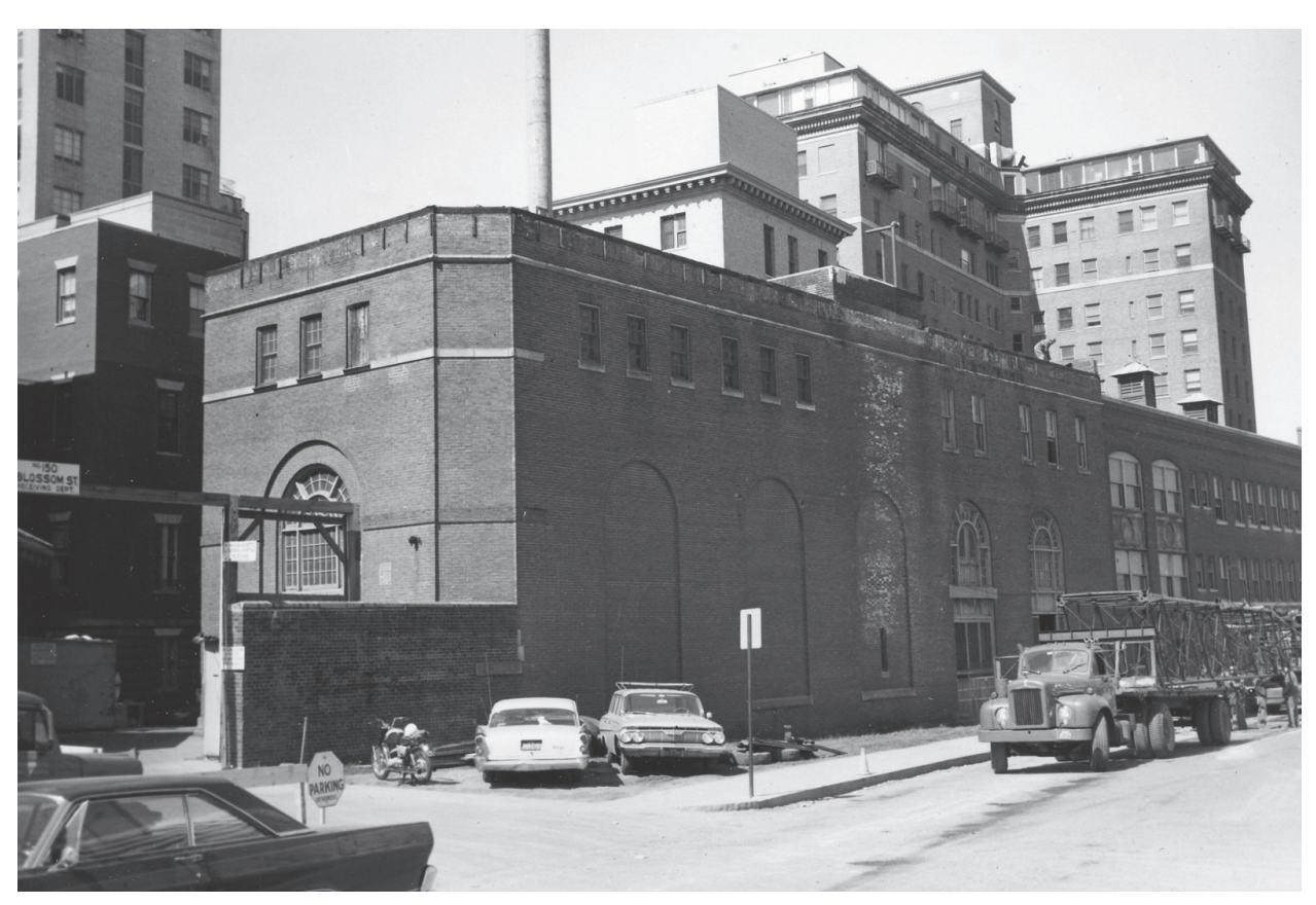
Figure 5.1 The Allen Street Building, which housed MGH Pathology from 1896 to 1956, shown during demolition

conditions in the old Allen Street House (figures 5.1 and 5.2) were not only inadequate but dangerous as well. For example, Dr. Mallory had previously praised the replacement of an old wooden staircase with a new steel one, commenting that it "has greatly increased the safety of the building." In the course of 1929: